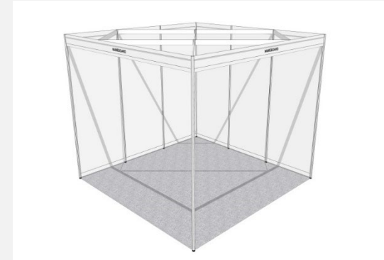
PICTURED: 3x3 enhanced shell scheme booth